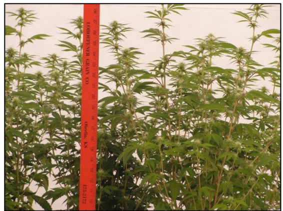
Grow Day 33 5/30/13 - Avg Height 27"