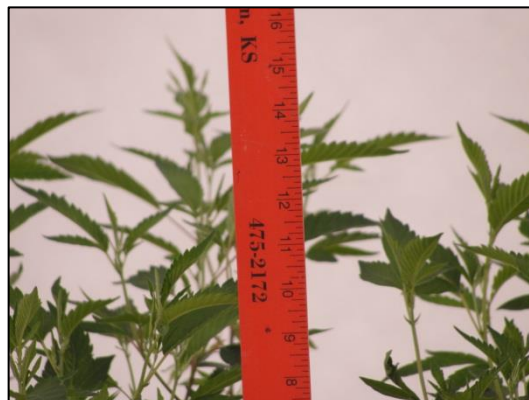
Grow Day 1 4/28/13 - Avg Height 13"