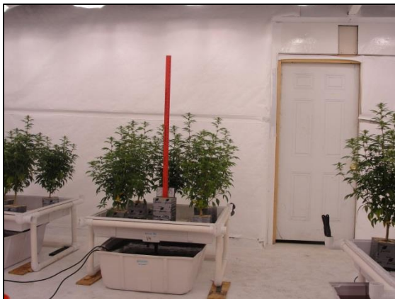
Grow Day 33 5/30/13