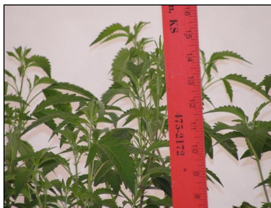
Grow Day 3 4/30/13 - Avg Height 14"