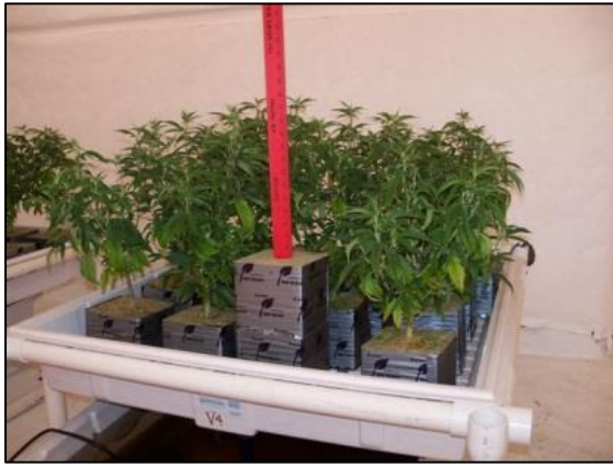
Grow Day 16 5/13/13 – Avg Height 16"