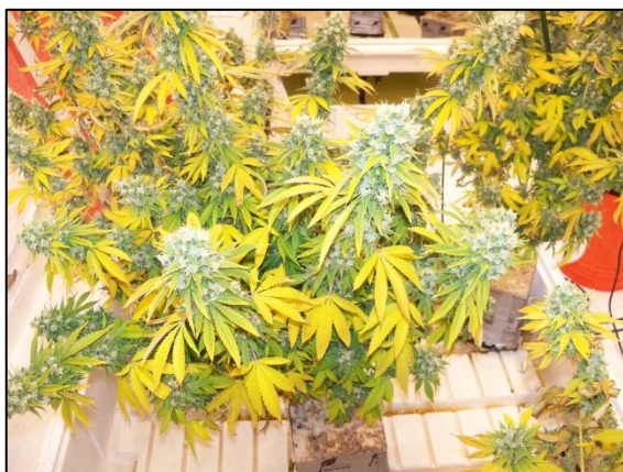
Grow Day 73 7/9/13