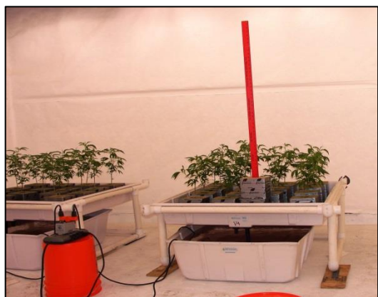
Grow Day 3 4/30/13