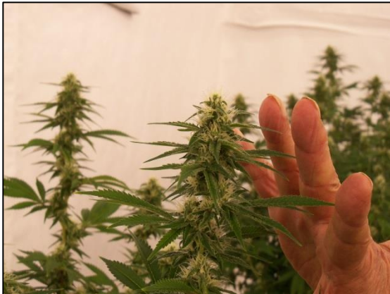
Grow Day 42 6/8/13