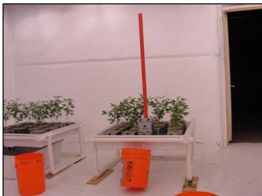
Grow Day 1 4/28/13