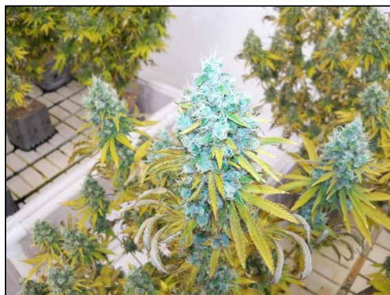
Grow Day 73 7/9/13