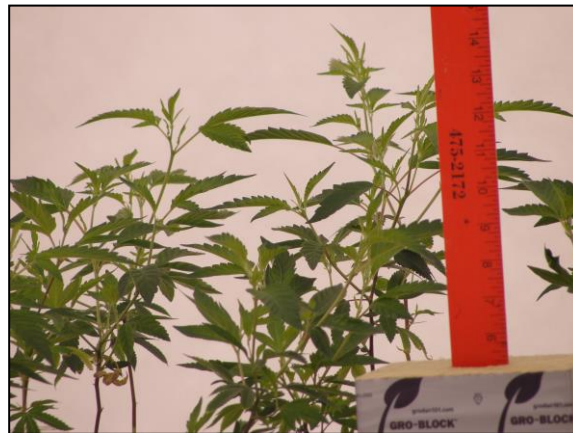
Day 0 4/27/13 - Avg Height 12"