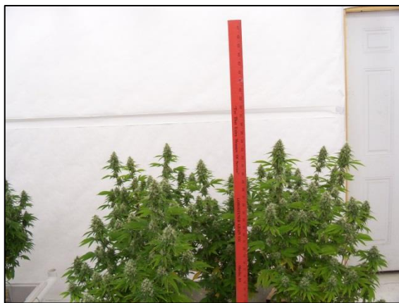
Grow Day 56 6/22/13 – Avg Height 33"