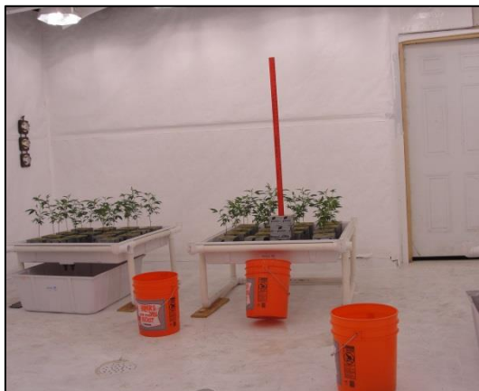
Day 0 4/27/13