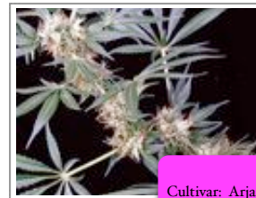
Cultivar: Arjan's Strawberry Haze Green House - Feminized