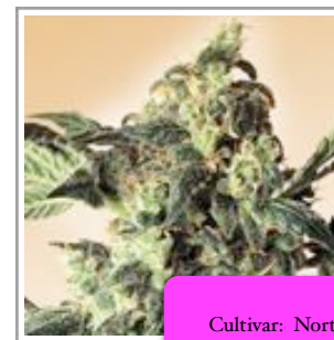
Cultivar: Northern Lights Sensi - Feminized

Northern Lights' fame extends to the harvest festivals where it claimed the overall High Times Cannabis Cup win in 1990, and the Cup's award for the pure Indica category in 1988-89.