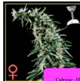
Cultivar: Hawaiian Snow Green House - Feminized