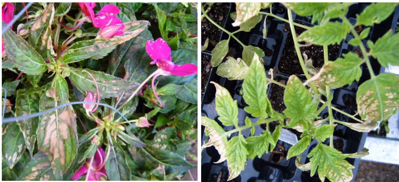
Figure 3. Symptoms of ammonium toxicity in New Guinea impatiens and tomatoes.

Certain conditions such as low temperatures (less than 60°F average daily temperature), water-saturated or low oxygen growing media, and low medium pH will suppress the function of nitrifying bacteria and cause ammonium to build up to toxic levels in the growing medium. Symptoms of ammonium toxicity include upward or downward curling of lower leaves depending on plant species; and yellowing between the veins of older leaves which can progress to cell death (Figure 3).