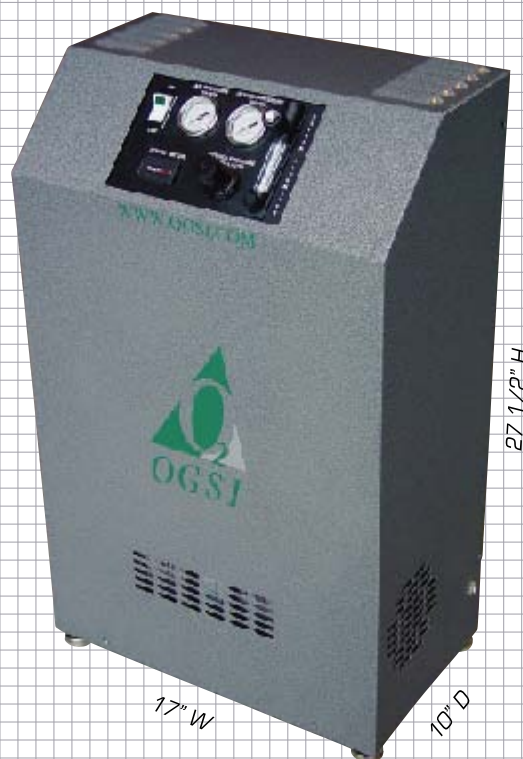
OG-15 WITH POWDER COATED STEEL COVER