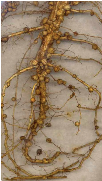
These soybean roots have nodules containing rhizobia that fix nitrogen for plant use.

The best example of a biofertilizer is the rhizobia discussed above that work with legumes such as clover, peas and beans. Each legume has a specific rhizobacteria that works best with that plant. Inoculating the legume seed with the correct bacteria ensures the legume will maximize nitrogen availability if nitrogen in the soil is low. This is particularly important if you have not planted the legume species before, because the correct bacteria may not be present in the soil.