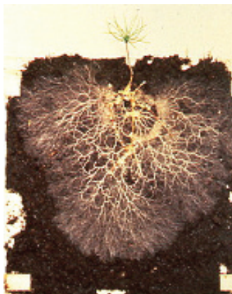
These pine seedling roots are infected with mycorrhizal fungi that allow the plant to obtain nutrients from a bigger volume of soil. (David Read, Oregon State University)

Interest in soil inoculants has grown with an increased recognition that soil biology plays an important part in crop production. Inoculants are used for a variety of reasons. In some cases, we add soil organisms that have a known beneficial effect. For example, rhizobia, a type of bacteria, form a symbiotic relationship with legumes. A symbiotic relationship is one that is mutually beneficial. In return for the plant feeding the rhizobia carbon from photosynthesis and giving it a home, the bacteria can “fix” atmospheric nitrogen into a form that the plant can use. Some fungi, like mycorrhizae, also form a symbiotic relationship with plants, scavenging phosphorus and other nutrients for the plant to use. Other bacteria and fungi do not form a symbiotic relationship with plants, but when added to soil, can promote plant growth, suppress plant pathogens or both.